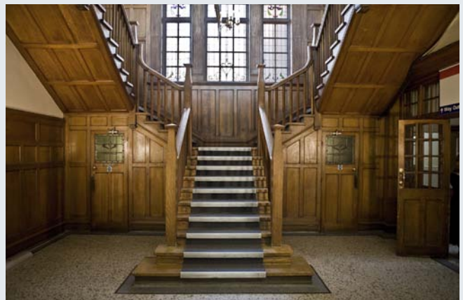
The original grand oak staircase that now leads to the administration part of the hospital